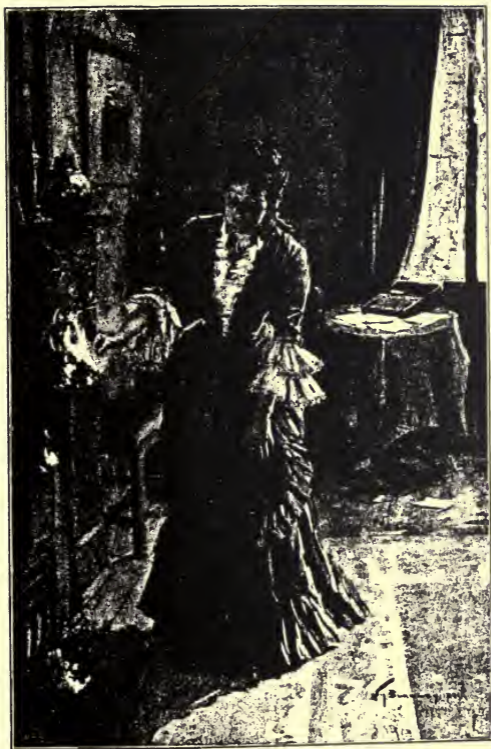
EACH LETTER SLOWLY CONSUMED TO ASHES